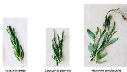
Figure 1- Sarcocornia perennis , Inula chritmoides and Halimione portulacoides

We worked with several maritime or halophyte species, namely: Sarcocornia perennis , Inula chritmoides and Halimione portulacoides (Figure 1).