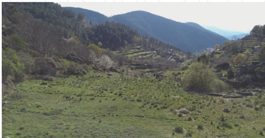
Figure 3. Mountain grasslands in Louriga, Serra da Estrela.

Mountain semi-natural meadows (“lameiros”) are one of the most characteristic elements of the mountain landscapes of northern and central Portugal [10], namely in the Serra da Estrela, dominated by complexes of spontaneous and sub-