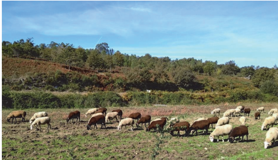
Figure 1. Native breed of dairy sheep “Bordaleira serra da Estrela” grazing.

characterized by hot and dry summers, generally cold and long winters and with some inter-annual and inter-monthly precipitation irregularity [4]. The soils are mostly of granite or schist origin, with low pH and low fertility, especially based on low organic matter levels [2].