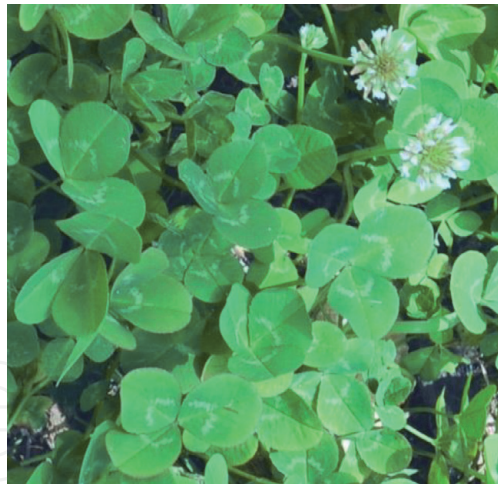
Figure 4. White clover ( Trifolium repens ).