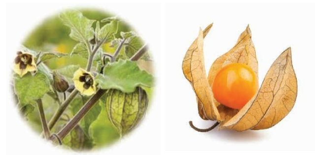
Figure 1: Physalis peruviana bush and fruit (Oliveira S.)

The colour of the physalis fruits was determined with a colorimeter (Chroma Meter - CR-400, Konica Minolta) in the CIE Lab colour space, by assessing the L^* , a^* and b^* Cartesian coordinates, and using the illuminant D65. The L^* axis represents Lightness and varies from 0 (corresponding to no lightness, i.e., absolute black) to 100, or maximum lightness (i.e. absolute white). The other axes