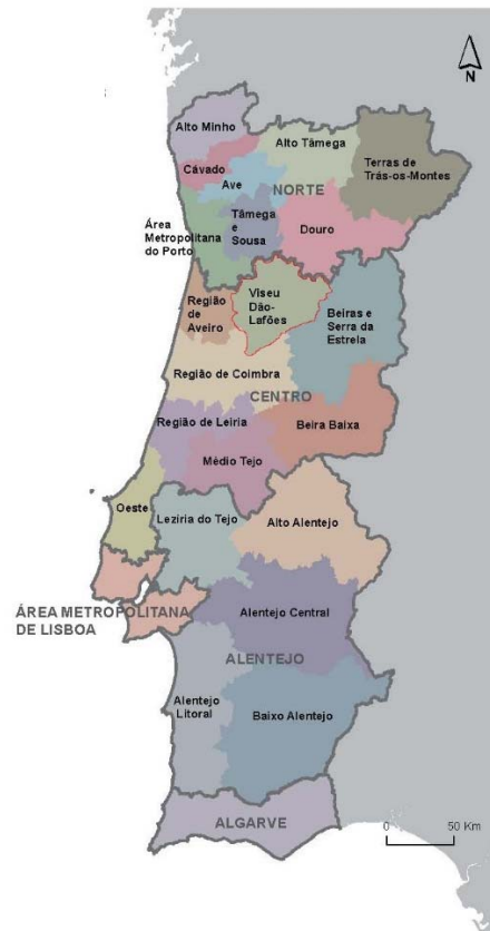
Figure 3 – Localization of visu Dão lafões Region in Portugal